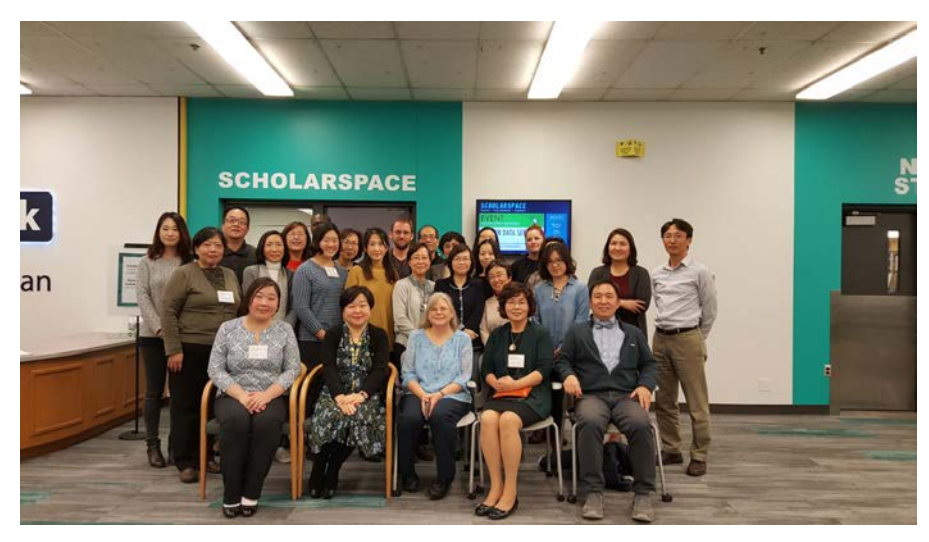
November 15-16, 2017 University of Michigan Library