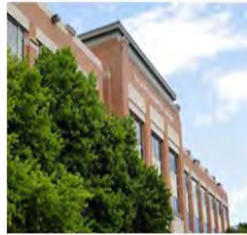
Virginia Science and Technology Campus Library