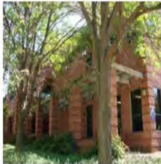
Eckles Library at the Mount Vernon Campus