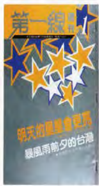
■1985年1月《第一線》週刊創刊。