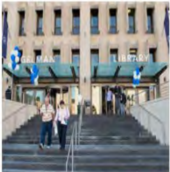
Estelle and Melvin Gelman Library