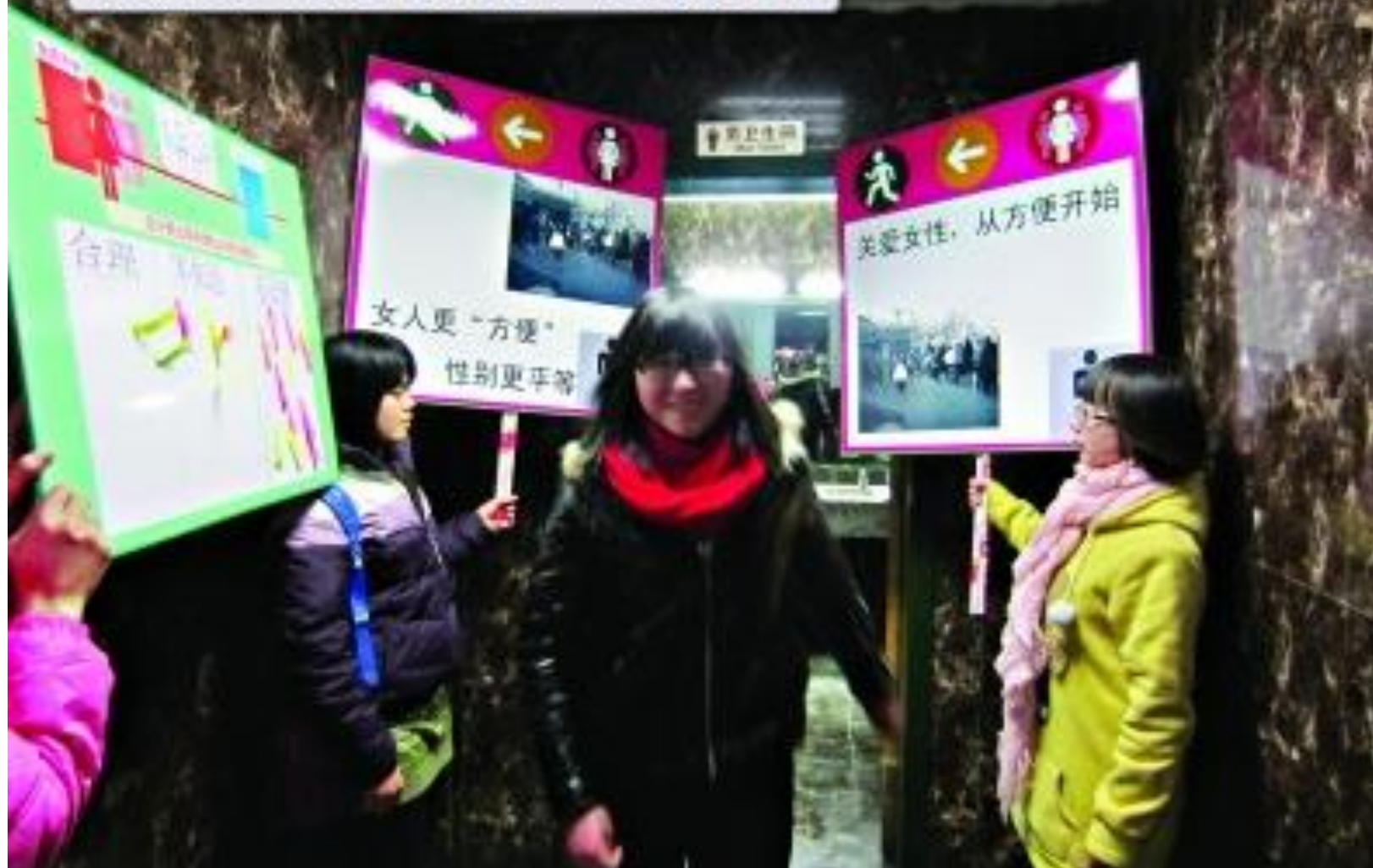
女大学生占领江滩男厕所。