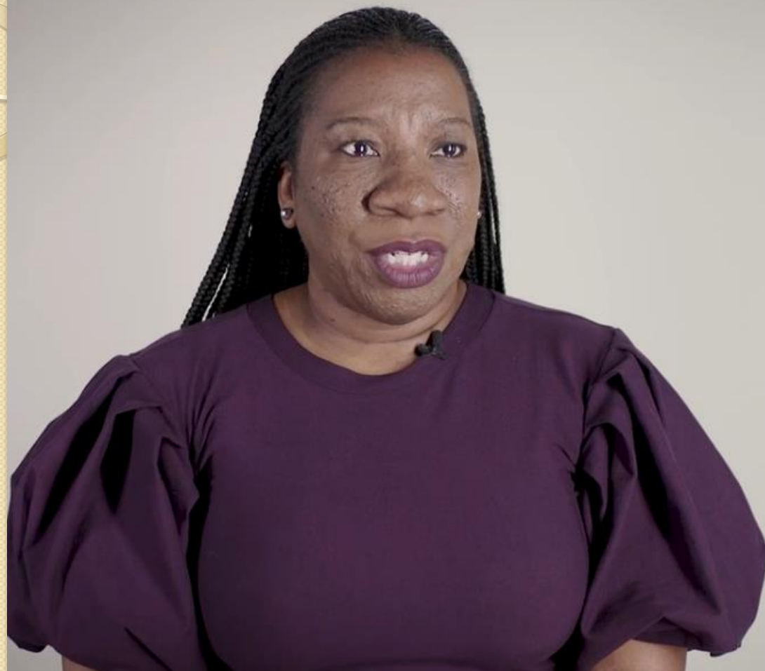
Tarana Burke "ME TOO" CREATOR