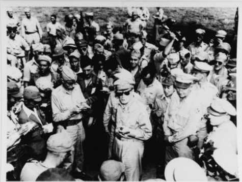
August 30, 1945