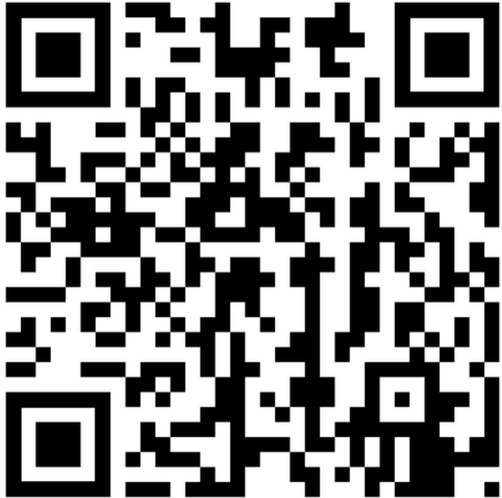
North Korean Propaganda Posters at Leiden University Libraries