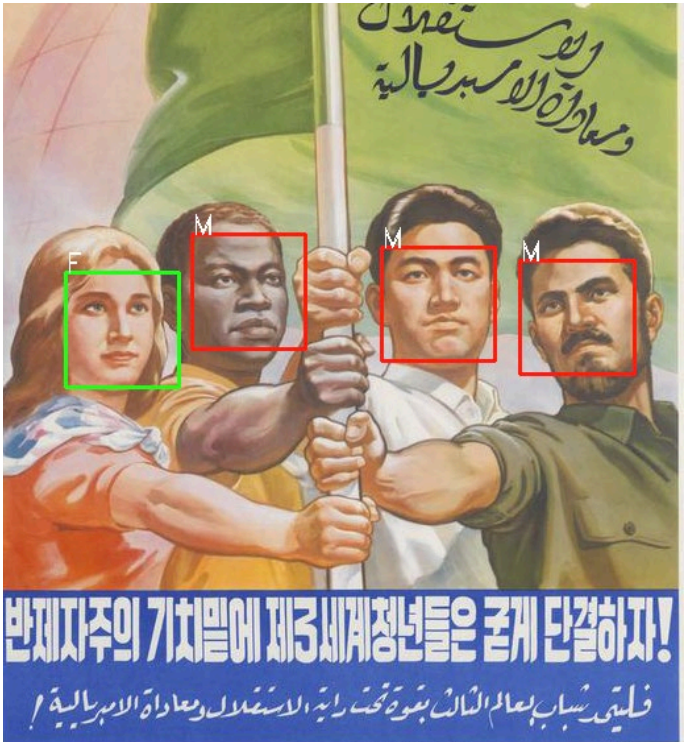
Gender distribution in posters analysis (Benjamin Young) https://shorturl.at/UBgBt