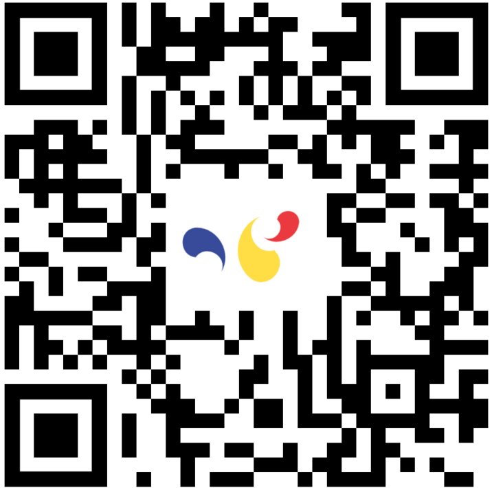
ENKRS website and listserv