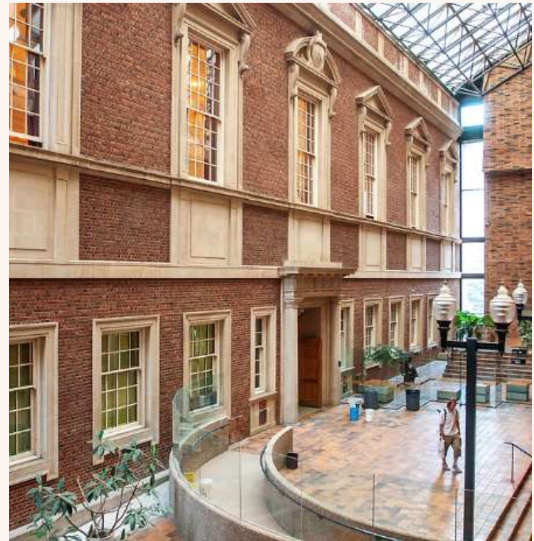
Rutherford Library, University of Alberta