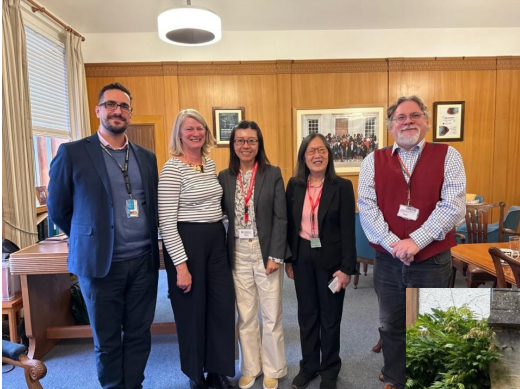
Cambridge and UCSD teams during the library exchange trip to Cambridge in September 2025