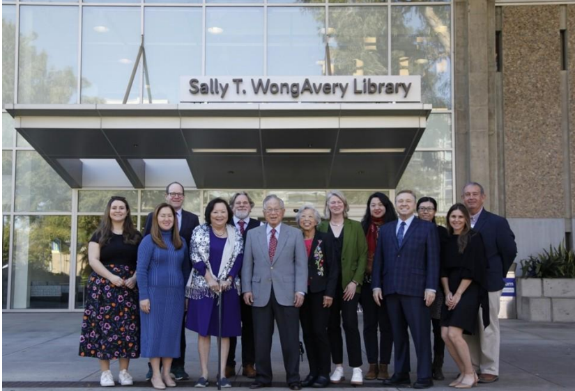
Cambridge and UCSD teams with members of the Foundation during the Library exchange trip to San Diego in January 2024