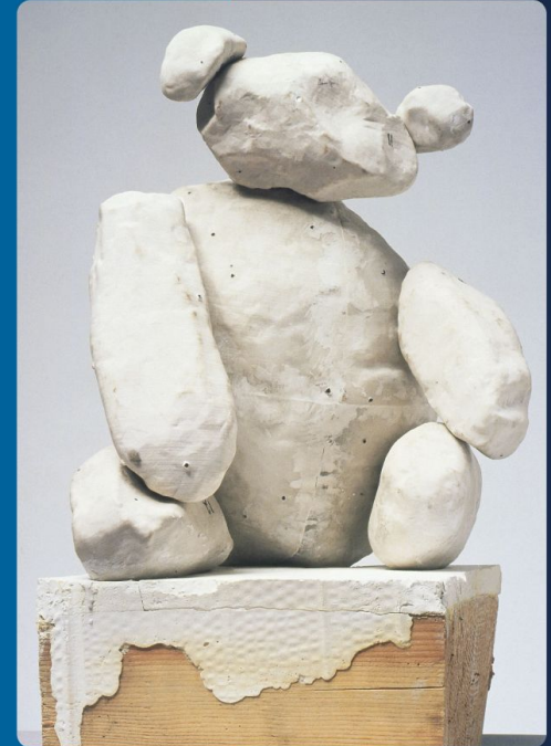
Bear: model: front view, from the Stuart Collection Photographs Collection Photographer: Gregoire, Mathieu (American conceptual artist, born 1953)