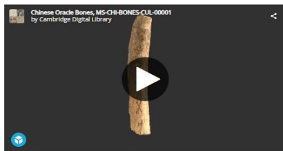
Cambridge UL Oracle Bone CUL1 on Sketchfab