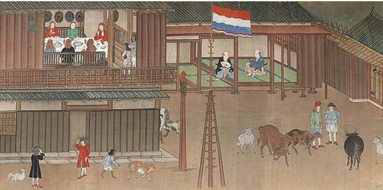
Dejima, the Dutch Trading Station at Nagasaki handscroll, about 1800 By Anonymous, Wikimedia Commons