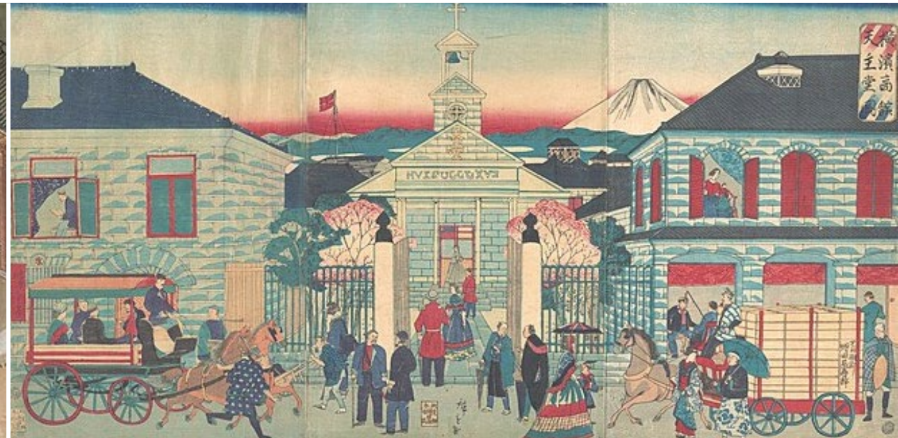
横浜商館天主堂ノ図 / Yokohama shōkan tenshudō no zu Illustration of Foreign Residences and the Catholic Church in Yokohama by 三代目歌川広重 / Utagawa Hiroshige III